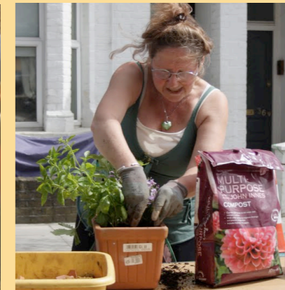
Last year's BEST Big Lunch

can help make the day a success. Could you run a stall or provide some music? Fancy organising kids activities? Please get in touch if you'd like to help.